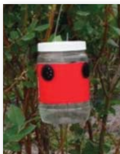
A trap and lure (Scentry Biologicals, Inc.) to monitor adult SWD numbers.