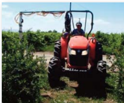
Applying biopesticides on blueberries.

There are problems all farmers share. In relation to pollinator health, IR-4 has conducted studies to manage varroa mite of honey bee. Additionally, weed management is a high priority need that IR-4 has been researching, to the benefit of sweet potato and ornamental