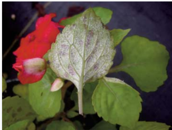
Impatiens downy mildew caused by Peronospora obduscens .

The activities here are two-fold. USDA-APHIS provided a cooperative agreement to continue research on Impatiens Downy Mildew (IDM) and several downy mildews impacting edible crops. And USDA-SCRI provided a planning grant to host a workshop to discuss and prioritize research and extension activities for downy mildews across environmental horticulture crops.