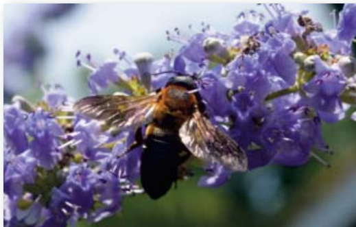
Pollinator visiting Chaste Tree ( vitex agnus-castus).

During the summer of 2016, the IR-4 Ornamental Horticulture Program was the beneficiary of several awards to facilitate research relating to pollinators, downy mildew, and boxwood blight. Each topic is an issue impacting ornamental horticulture growers in a unique way. Both pollinators and downy mildew affect wide swaths of the growing community while boxwood blight touches a small, but significant slice. Outcomes from each project will benefit growers, but consumers, scientists, the regulators, and the crop protection industry will all gain in knowledge and experience in how best to manage each respective issue.