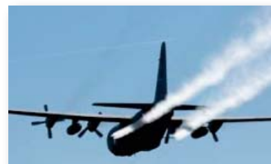
This Air Force spray plane can treat very large areas quickly.