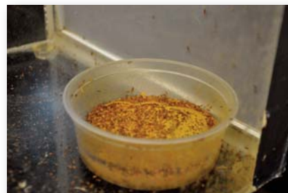
Netted Spotted Wing Drosophila around a food source

crops based on data developed by IR-4 Study Director, Keith Dorschner and it continues to be the most reliable tool for management of SWD. To avoid resistance, which is also a concern in organic berries there are limitations in the number of Entrust applications that can be used. Research has indicated that Chromobacterium subtsugae (Grandevo) is an effective rotational product in combination with Entrust. Sabadilla (Veretran D) has also shown potential but has been more difficult to evaluate with small plot sprayers. There has been some efforts to incorporate attractants, but benefits have not been as clear in comparison with Entrust- Grandevo rotations alone.