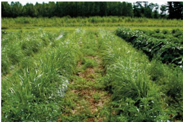
Tiger Nuts fields at Rutgers Hort Farm.

In other parts of the world including Spain and Africa, chufa has been extensively cultivated since ancient times. In North Africa, including Egypt, there is evidence that tiger nuts have been cultivated for over 6,000 years. In fact, the tubers were found in the tombs of pharaohs. Some sources also indicate that Egyptians made the tubers the world's first cultivated food. The main growing region of tiger nuts continues to be in North Africa and Spain. However, cultivation has also been reported in Florida and California.