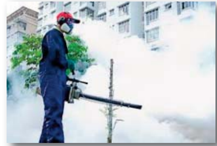
Hand application of mosquito adulticide in an urban site.

for the near future at least, we will depend on conventional toxicants as the major mosquito control intervention, and their regulatory status is of critical importance.