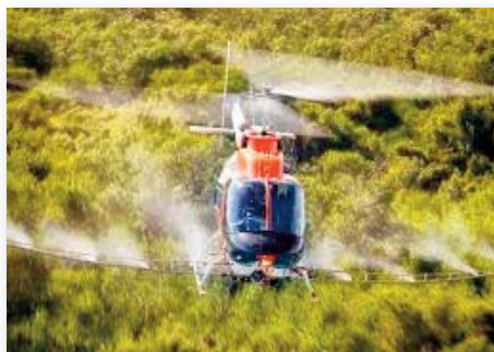
Helicopters are often used to treat inaccessible habitats

It seems highly unlikely that any of these reviews will lead to a cancellation of active ingredients by regulators, but expensive new requirements for data to evaluate safety or new label requirements designed to reduce exposures could lead to products leaving the already small toolbox. In addition, efforts to reduce dose could have unintended consequences including poor control of disease vectors, the need for repeated applications, development of residues, and/or increasing resistance. Thus, IR-4 is working closely with vector control personnel, regulators, and product registrants to help ensure that the best possible science is brought to bear on these questions. 🌱