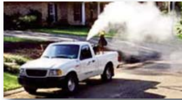
Ground application of mosquito adulticide is common in suburbs.

facing it. A range of new mosquito control techniques are being developed, many with IR-4 support, but none have yet been recommended by public health agencies for widespread use. Thus,