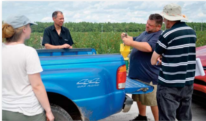
The team examines a lure trap in the blueberry field