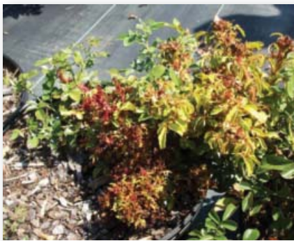
Symptoms of Rose Rosette Disease: Witches' brooms and small distorted leaves.

It is not often that virus diseases actually kill their host plant. Rose Rosette Disease (RRD) does. Infected roses can die within two years, but in many cases infected roses can live for several years and serve as a source of the disease for surrounding plantings. This disease was first observed in the Rocky Mountains in the 1940's, but RRD was only recently described as being caused by a double-stranded RNA virus in the Emaravirus group. This virus is vectored by and can replicate