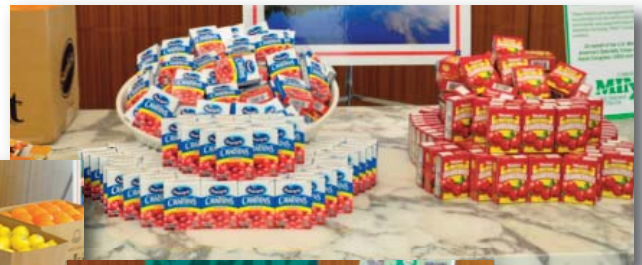
see more pictures at http://ir4.rutgers.edu/photogallery.htm