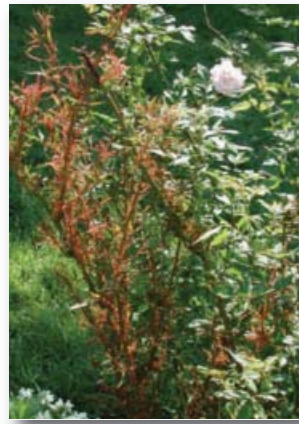
Symptoms of Rose Rosette Disease: Leaf reddening and rapid stem elongation.

If RRD was restricted to multiflora rose, there would be little concern about this disease. While rose appears to be the only susceptible ROSACEAE host, most members of the genetically complex modern rose are susceptible to RRD as are numerous rose species. Rosa bracteata is the notable