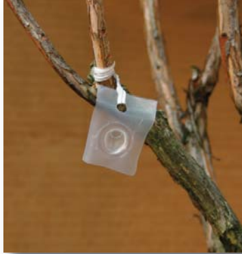
Retrievable AgBio dispensers

In a project funded by IR-4 (2008-2009) we recently determined that, at least with low-dose dispensers, mating disruption for oriental beetle works by competitive attraction as the behavioral mechanism of disruption; thus, increasing the density of dispensers per hectare (acre) will provide better disruption. More recently (2011), IR-4 has funded a project to evaluate "field-wide oriental beetle mating disruption in blueberries: a new, more realistic approach for its control."