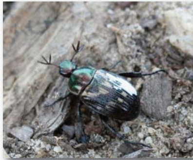
Oriental beetle male

Oriental beetles are invasive pests, probably native to the Philippine Islands. In the northeast US, it was first detected in Connecticut in 1920, and since then it has become an important pest of turf, ornamentals, and several food crops in the region, including blueberries. The larvae can cause considerable damage by feeding on the roots of plants. Application of traditional chemical insecticides against this pest may be expensive, and susceptibility of grubs to