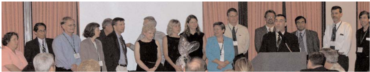
Some IR-4 HQ team members gathered to say thanks.