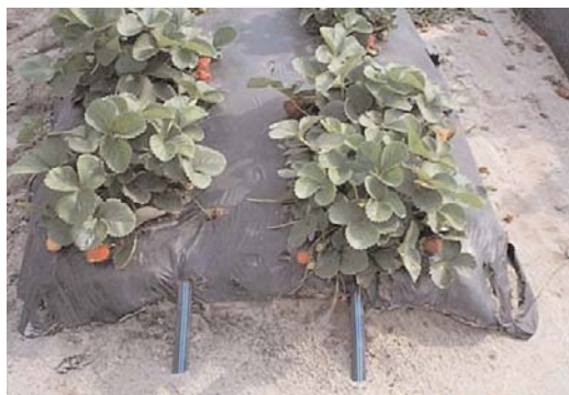
Florida strawberries treated with Chloropicrin in the beds followed 6 days later with Vapam applied at 75 gallons per acre through two drip tapes per bed. This treatment produced excellent strawberry yields equal to the Methyl Bromide/Chloropicrin standard treatment.

Two years ago, with the phase out deadline for methyl bromide (MeBr) looming, university staff and industry representatives along with IR-4 asked the question: methyl bromide alternatives, are we there yet? At that time the answer was yes and no. Since then, as a result of a great deal of research, some promising alternatives have become evident. These products are effective and perform consistently only when used with deliberate, well-planned applications, precise soil preparation and proper irrigation.