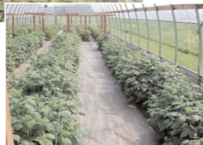
High Tunnels and Hoop Houses in Pennsylvania