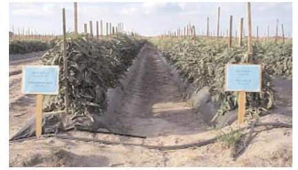
Side by side comparisons in IR-4 tomato tests in FL, where chloropicrin was incorporated into the beds on the right and Telone II on the left with each followed 7 days later with Vapam applied at 75 gallons per acre through 2 drip tapes per bed. These were the leading treatments in the test, producing tomato yields equal to the Methyl Bromide/Chloropicrin standard treatment.

information contact IR-4 or visit the IR-4 website. ▲