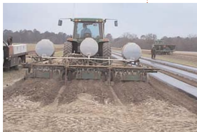
The in-bed application shows the plastic and drip tape being laid behind the shank injection of K-Pam @60 gpa. The K-Pam was shanked into a false bed and no gas was detected so they proceeded to press the bed, lay tape and plastic mulch.

Two of the effective MeBr replacement programs consist of products containing the active ingredients metam sodium (MS) and metam