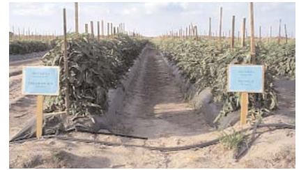
Side by side comparisons in IR-4 tomato tests in FL, where chloropicrin was incorporated into the beds on the right and Telone II on the left with each followed 7 days later with Vapam applied at 75 gallons per acre through 2 drip tapes per bed. These were the leading treatments in the test, producing tomato yields equal to the Methyl Bromide/Chloropicrin standard treatment.

information contact IR-4 or visit the IR-4 website. ▲