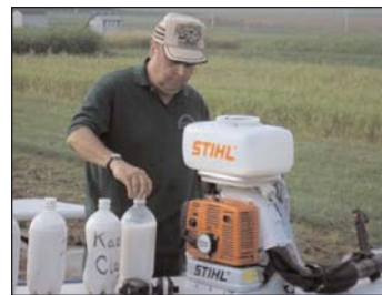
Mixing Kaolin-based SURROUND WP solution for backpack mist blower sprayer demonstration.